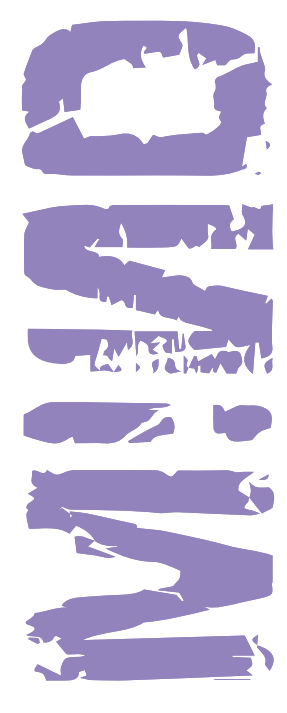
A Report on BME Mental Health Service Provision in Croydon